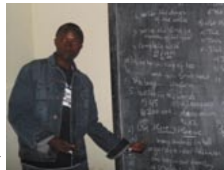
Tubeho English course.