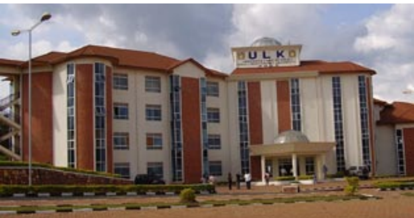
Photo of the Université Libre de Kigali.

“THANKS TO YOUR GENEROSITY, WE ARE BETTER PREPARED TO FACE LIFE’S CHALLENGES, TO GROW AND MATURE PERSONALLY, SOCIALLY, AND PROFESSIONALLY.”