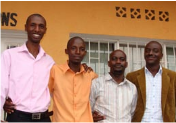
Tubeho Executive Committee after one of the meeting when they discussed and selected the new FoT fellows in January 2011.